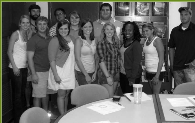
Agribusiness Club Members

To be successful, the club needs the support of alumni. Would you be willing to be a speaker at one of the club meetings, or if you are close to Knoxville, host the club for a field trip? Having incentives, such as door prizes, to get students to the meetings also helps.